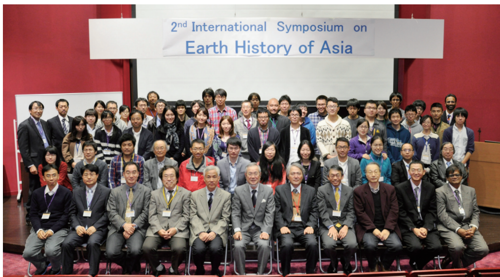
Fig. 2. Group photograph of the participants in the scientific session of the 2nd International Symposium on Earth History of Asia held at the University Library Hall, Niigata University (Ikarashi campus).