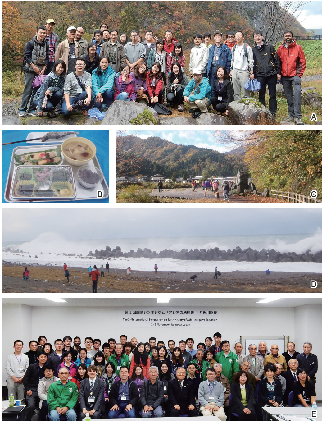
Fig. 4. Field excursion and panel discussion in the Itoigawa Global Geopark. A. Group photograph at the Kotakigawa Jade Gorge Geosite, B. Traditional lunch prepared by Kotaki residents, C. Field observation at the Fossa Magna Park (Itoigawa-Shizuoka Tectonic Line), D. Jade collection at the Omi Coast Geosite, E. Group photograph of the participants in the outreach session and panel discussion at the Itoigawa City Hall.