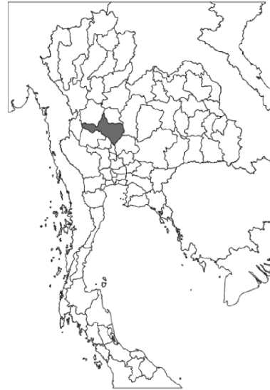
Fig 1. Location of Nakhon Sawan province http://n.freemap.jp/tw/20150311_10553151037

culantro, chili peppers, corn, and other vegetables and fruit are the main agricultural products in this area.