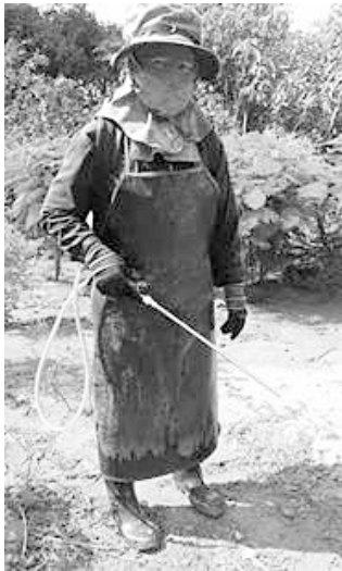
Fig 3. Instance of farmer's protection

shop. Our survey indicated that the shop sold one type of gloves (25 baht) and one type of mask (10 baht); however, eye protection, such as goggles or safety glasses, was not available. Farmers had to go outside the village to seek these items.