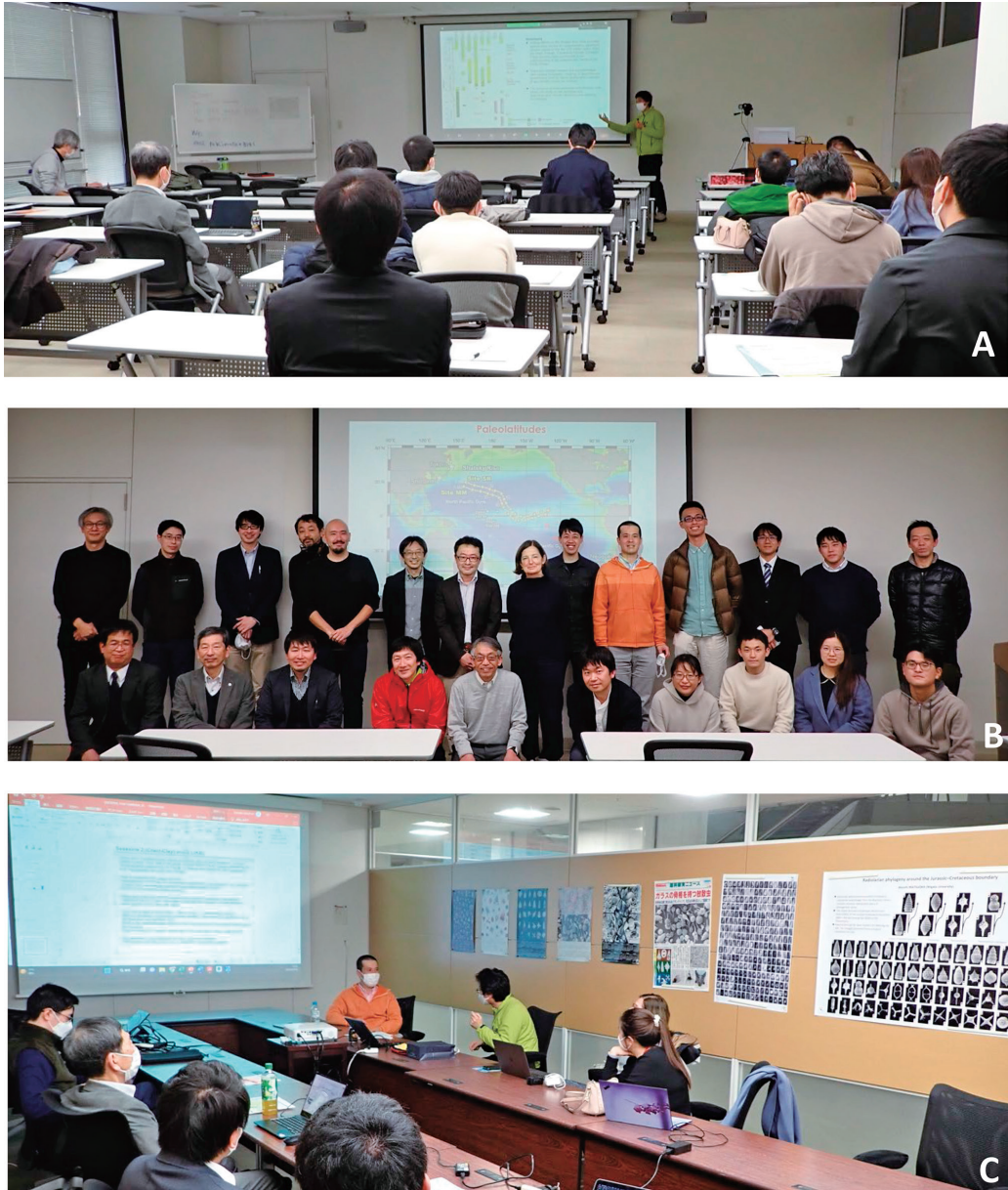
Fig. 3. Photographs of the workshop. A. The workshop was held in Lecture Room in the TOKIMATE on 18 March, B. Group photograph of the participants of the workshop, C. Separate meeting (Mesozoic chert session) on 19 March in Meeting Room A in the TOKIMATE.