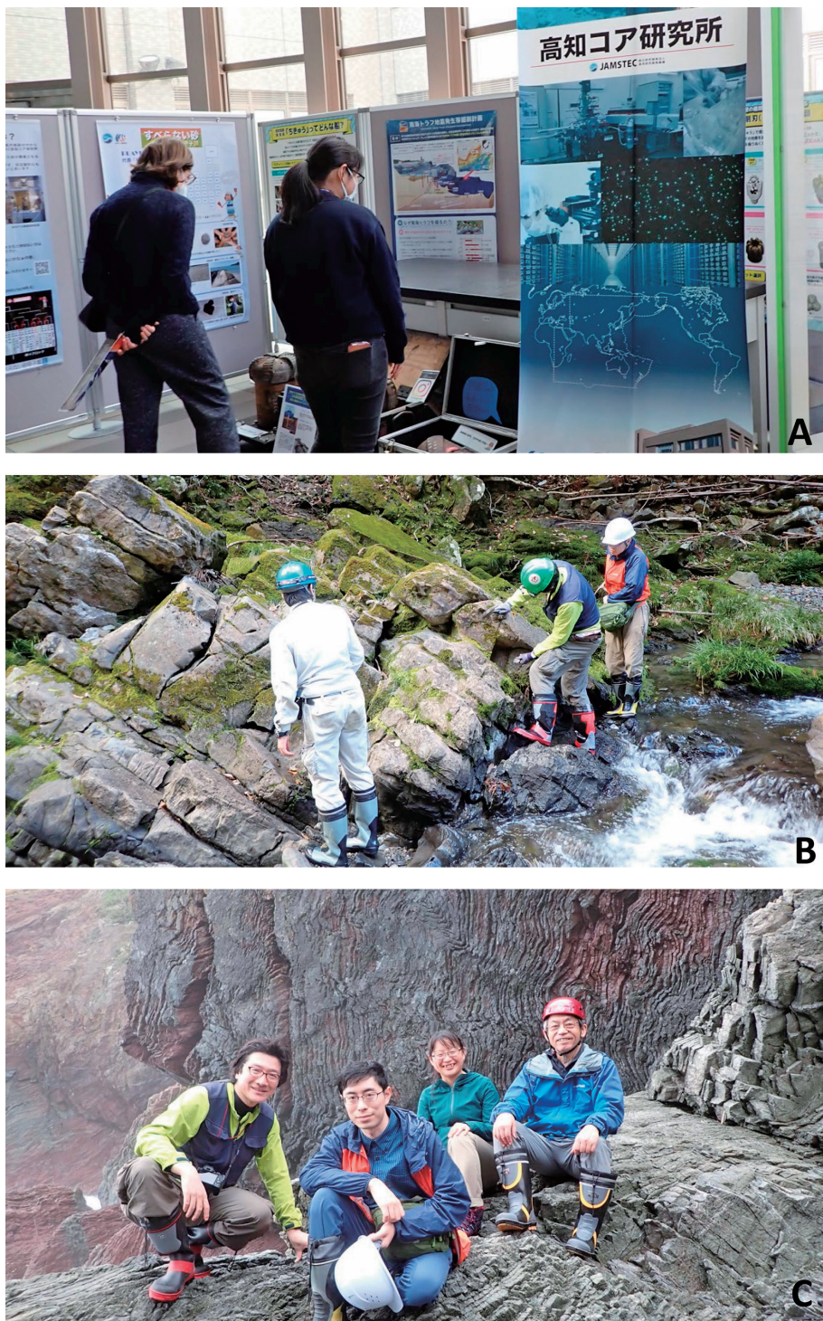
Fig. 4. Post-workshop activities in Kochi. A. Visit to the Kochi Core Center in Nankoku City on 20 March, B. Sampling in the Birafu section in Kami City on 21 and 22 March, C. Group photograph on the lower Cretaceous Yokonami chert in Susaki City on 23 March.